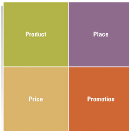
Figure 2.1 Each of the elements that make up the marketing mix must be executed effectively for a marketing program to achieve the desired results.

1. DO NOT 2. SOFTEN 3. TOGETHER 4. WON 5. ABO