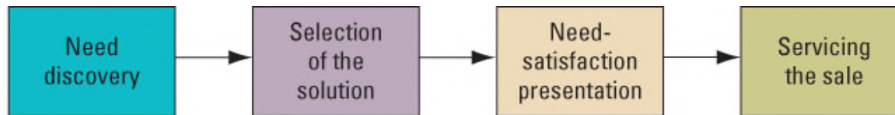
Figure 2.2 The Consultative Sales Presentation Guide. This contemporary presentation guide emphasizes the customer as a person to be served.